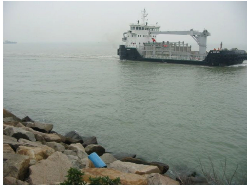
VSR3 - SEA OF DEEP BAY