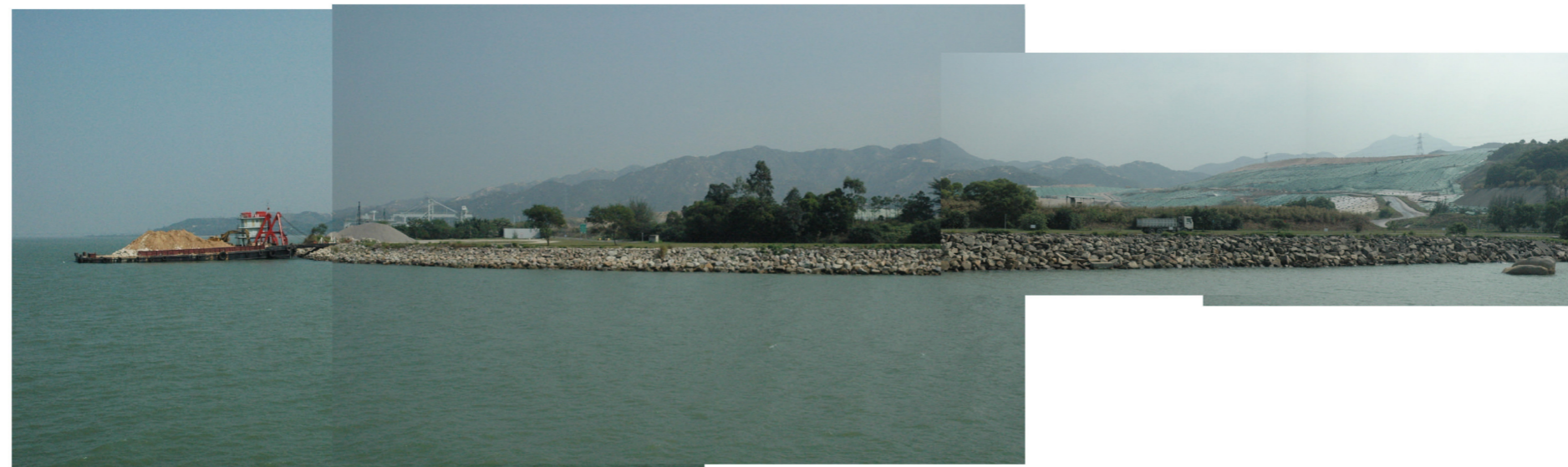
VSR5 - WENT LANDFILL SITE